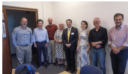
IFAC Executive Officers 2020-2023 after their post-Council meeting on 14 July 2022 at Imperial College, London, UK.