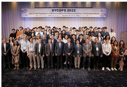
DYCOPS 2022 participants at the symposium banquet

to operate in a hybrid form by reflecting the opinions of those who wished to participate DYCOPS 2022. This challenging task was made easier for the IPC and NOC chairs by the strong support of the sponsors: we had 6 gold sponsors (4 Korean companies: GS Caltex, LG Chem, Hyundai Oilbank, Hyundai Motor Company, 1 Korean research center: Engineering Development Research Center, 1 foreign global company: Aramco), 4 silver sponsors (SK gas, CJ Cheiljedang, Hanwha Total Energies, and Busan Tourism Organization), and 1 bronze sponsor (LG Energy Solution). In addition, Seoul National University, the Korean Institute of Chemical Engineers, the Institute of Control, Robotics, and Systems, and KAIST assisted us greatly with the financial and administrative aspects of organizing the symposium.